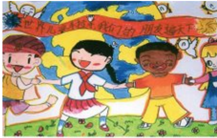
image001.jpg 40K View Download